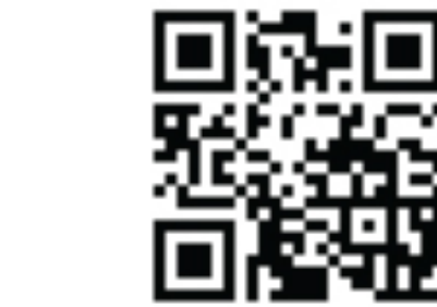
Bachelor of Social Sciences (Hons) in Psychology