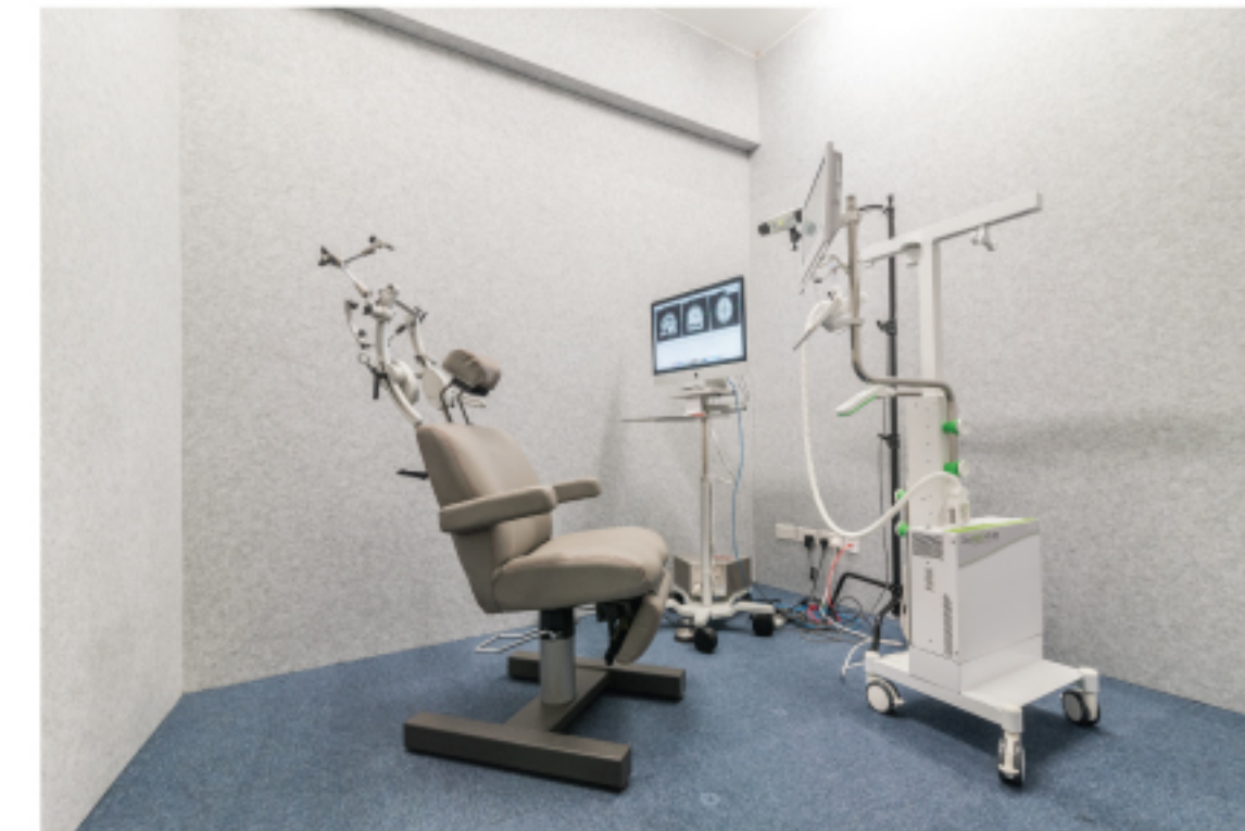
經顱磁刺激實驗室 Transcranial Magnetic Stimulation (TMS) Laboratory