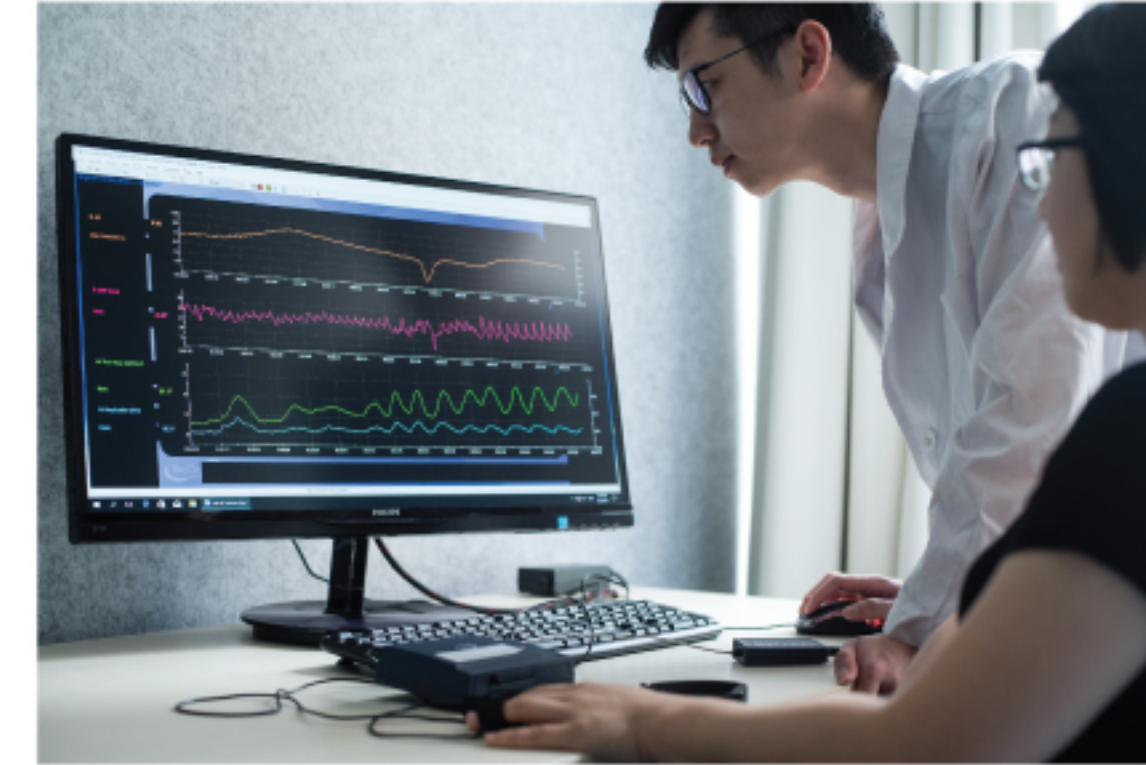
生理評估實驗室 Physiological Assessment Laboratory