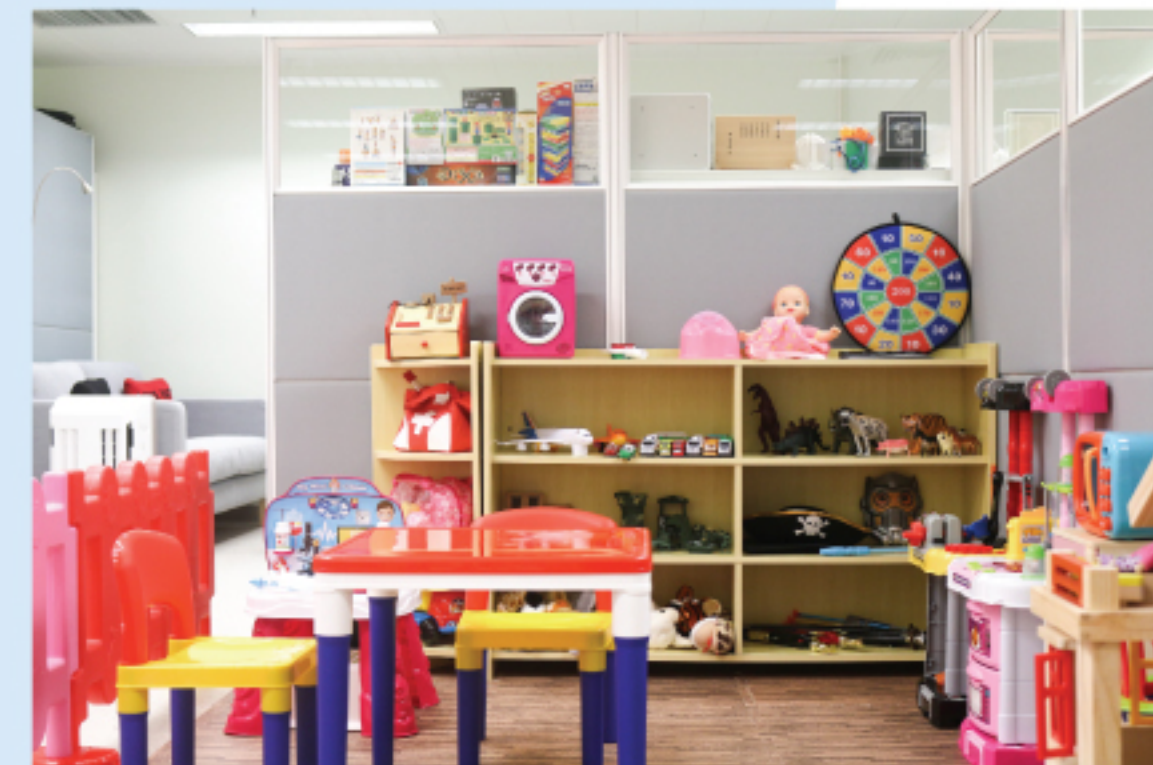
學校輔導及心理實驗室 School Psychology Laboratory