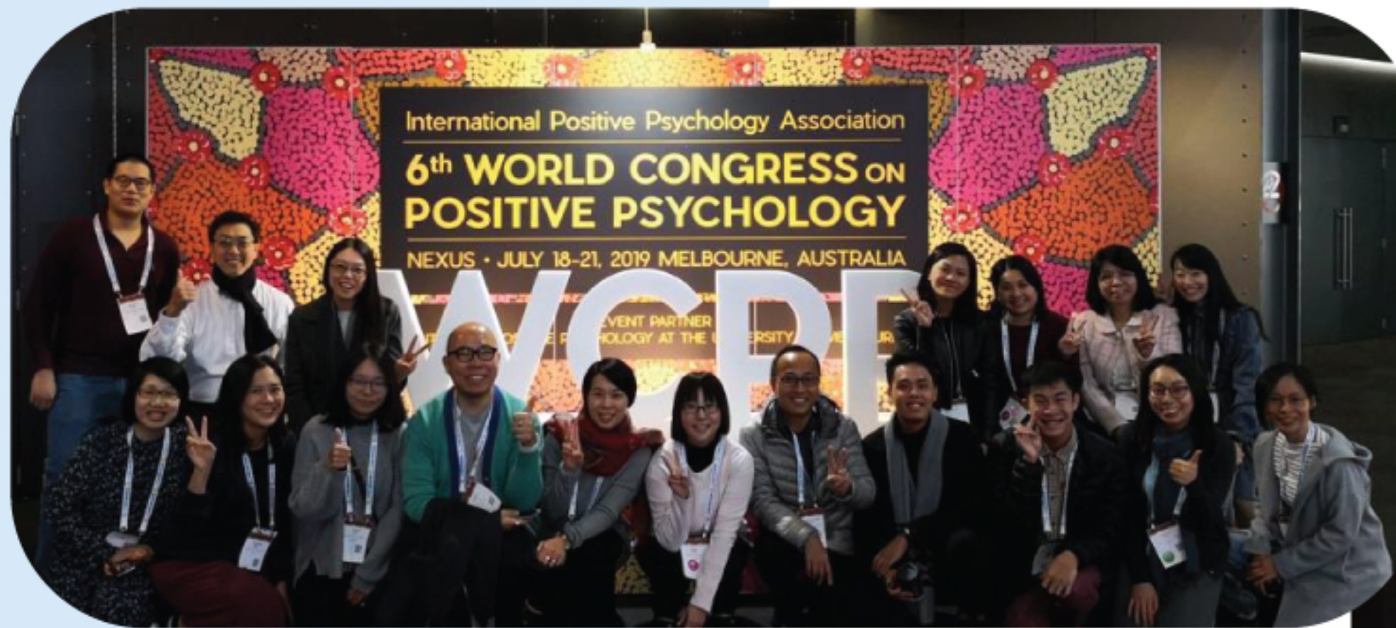
學系師生參加了2019年7月18-21日於澳洲墨爾本舉行之第六屆IPPA國際會議 IPPA (International Positive Psychology Association) 6th World Congress July 18-21, 2019 @ Melbourne.