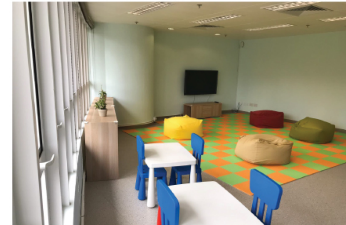
正向心理學實驗室 Positive Psychology Laboratory