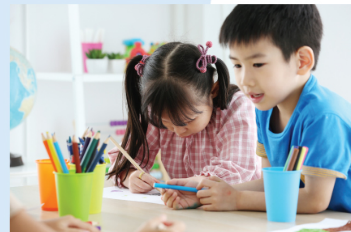
藝術創意心理實驗工作室 Psychological Lab Studio of Art and Creativity