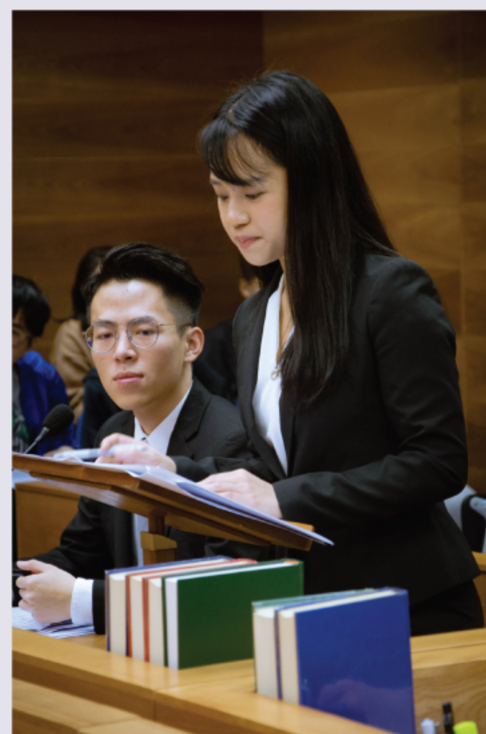
四年級學生於仁大模擬法庭模擬刑事訴訟程序 Year Four students role-playing the criminal procedure in the Moot Court in SYU