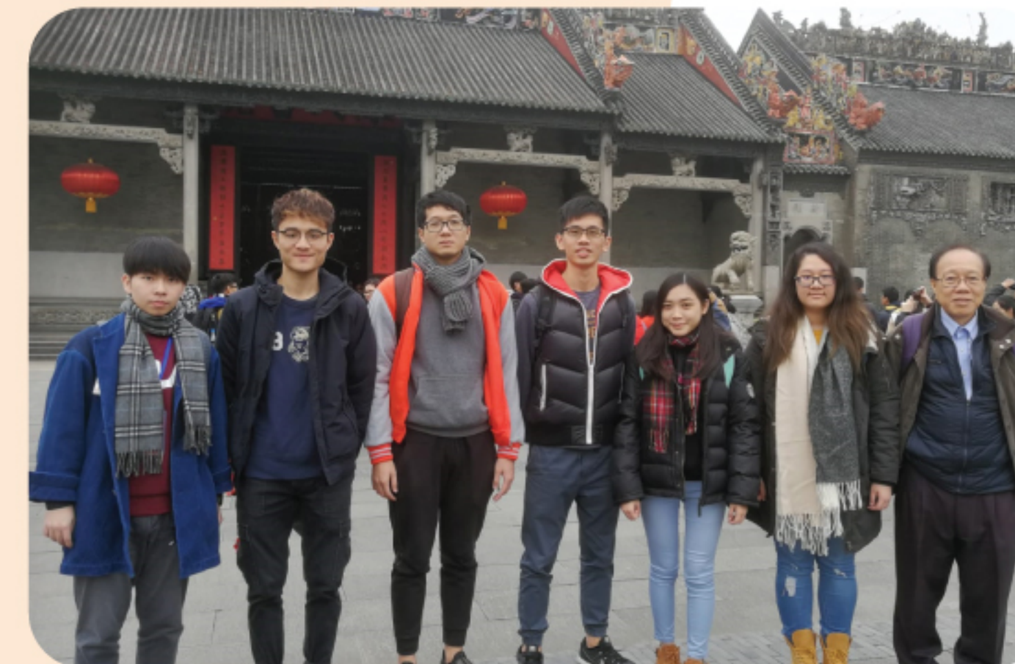
30名同學及2名老師參與由樹仁歷史學系與暨南大學合辦的「暨南大學交流團 2019」 30 students and 2 staff participated in "Jinan University study tour 2019" organised by the Department of History and Jinan University