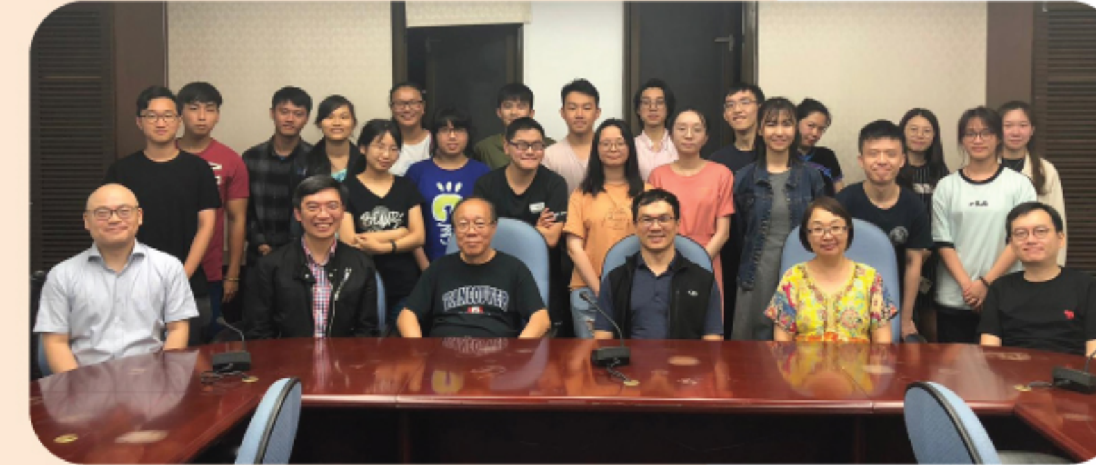
12名同學及3名老師參與由樹仁歷史學系與國立臺北大學合辦的「國立臺北大學交流團 2019」 12 students and 3 staff participated in "National Taipei University study tour 2019" organised by the Department of History and National Taipei University