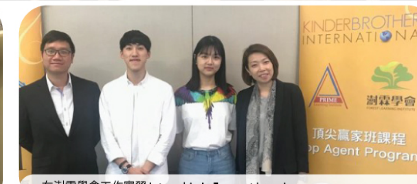
在樹霖學會工作實習 Internship in Forecast Learning