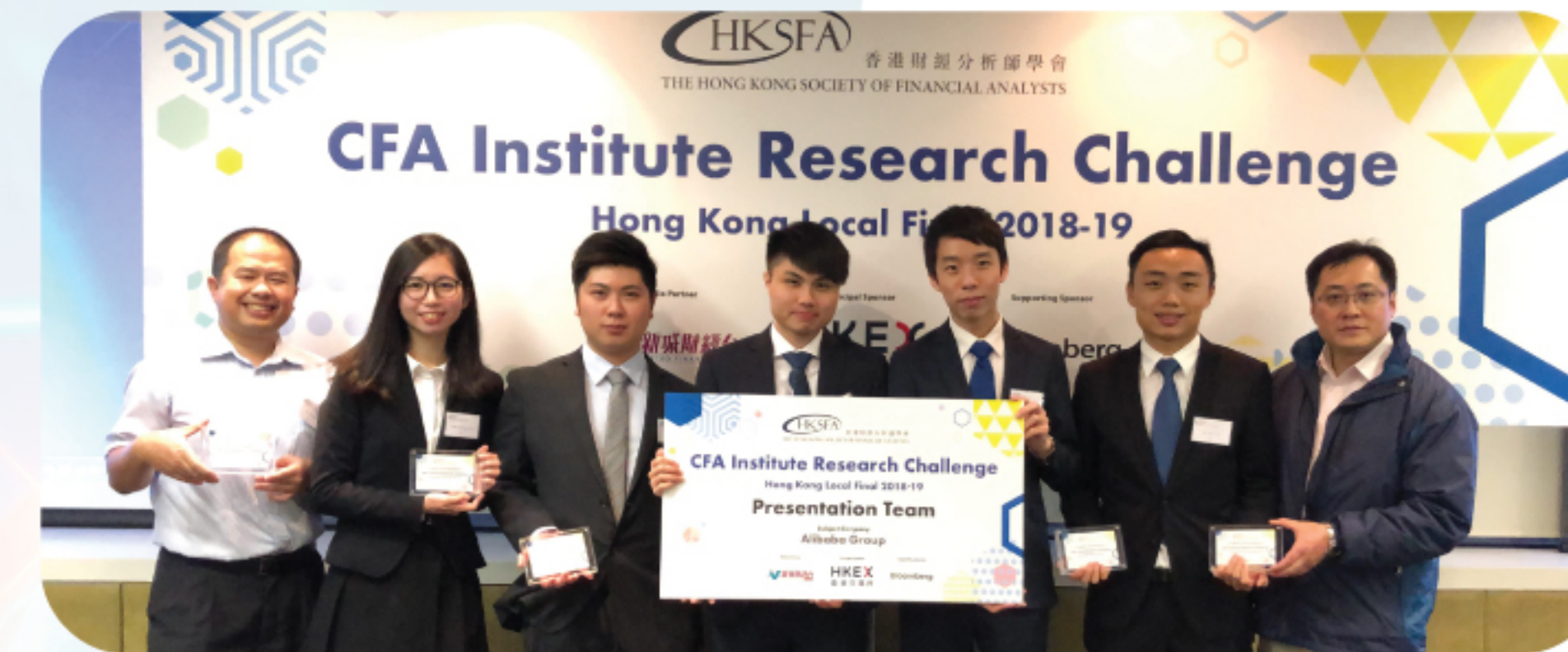
(左圖)特許金融分析師協會投資研究挑戰大賽 Left: CFA Institute Research Challenge