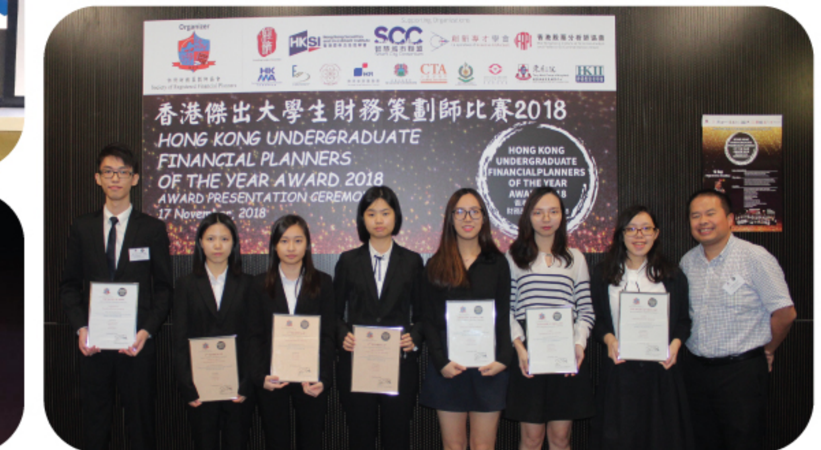
香港傑出大學生財務策劃師比賽 2018 Hong Kong Undergraduate Financial Planners of the Year Award 2018