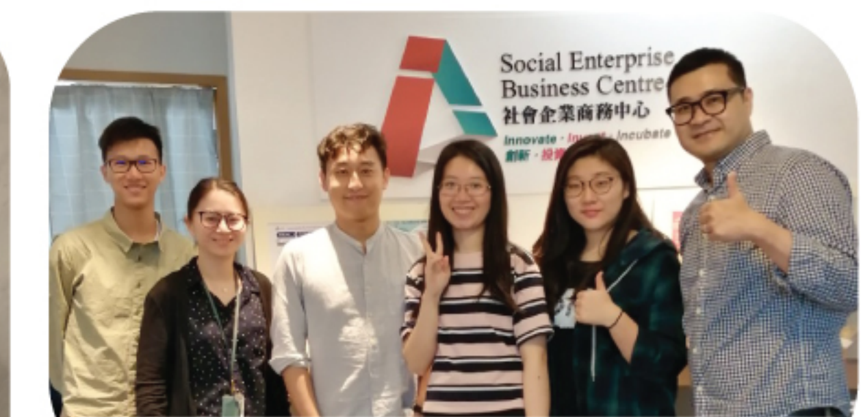
在社會企業商務中心工作實習 Internship in Social Enterprise Business Centre