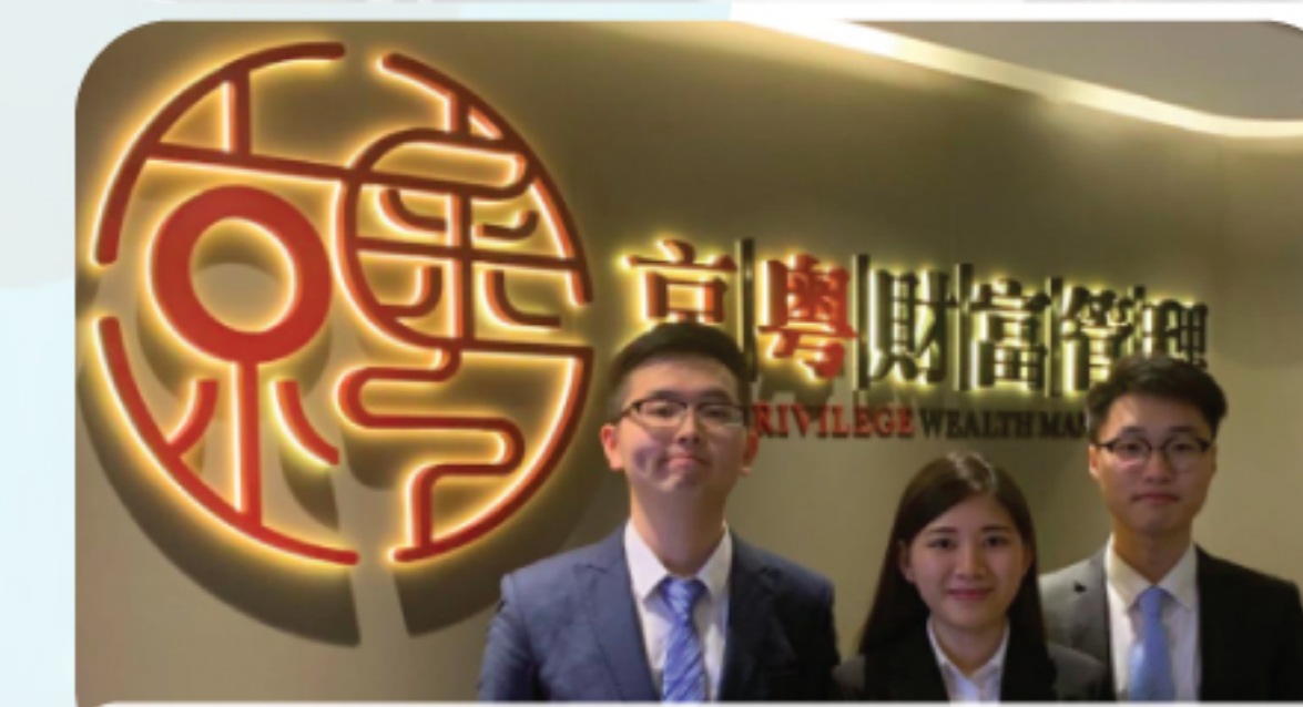
在京粵財富管理工作實習 Internship in King Privilege Wealth Management