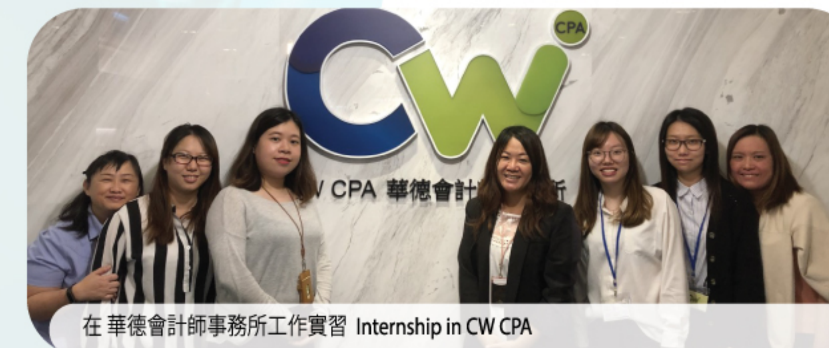
在華德會計師事務所工作實習 Internship in CW CPA

參加實習課程的學生有機會在各個專業領域工作，包括會計師行，財富管理機構、教育機構和社會企業等。 Students participated in Internship experienced working in professional settings in accountancy, financial planning, learning agency and social enterprise.