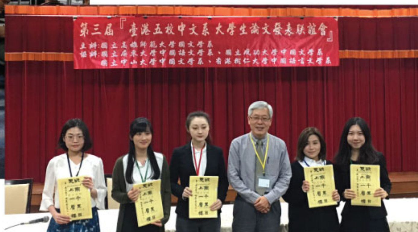
本系學生發表後獲頒證書。 Our students received certificates after presenting their academic papers.