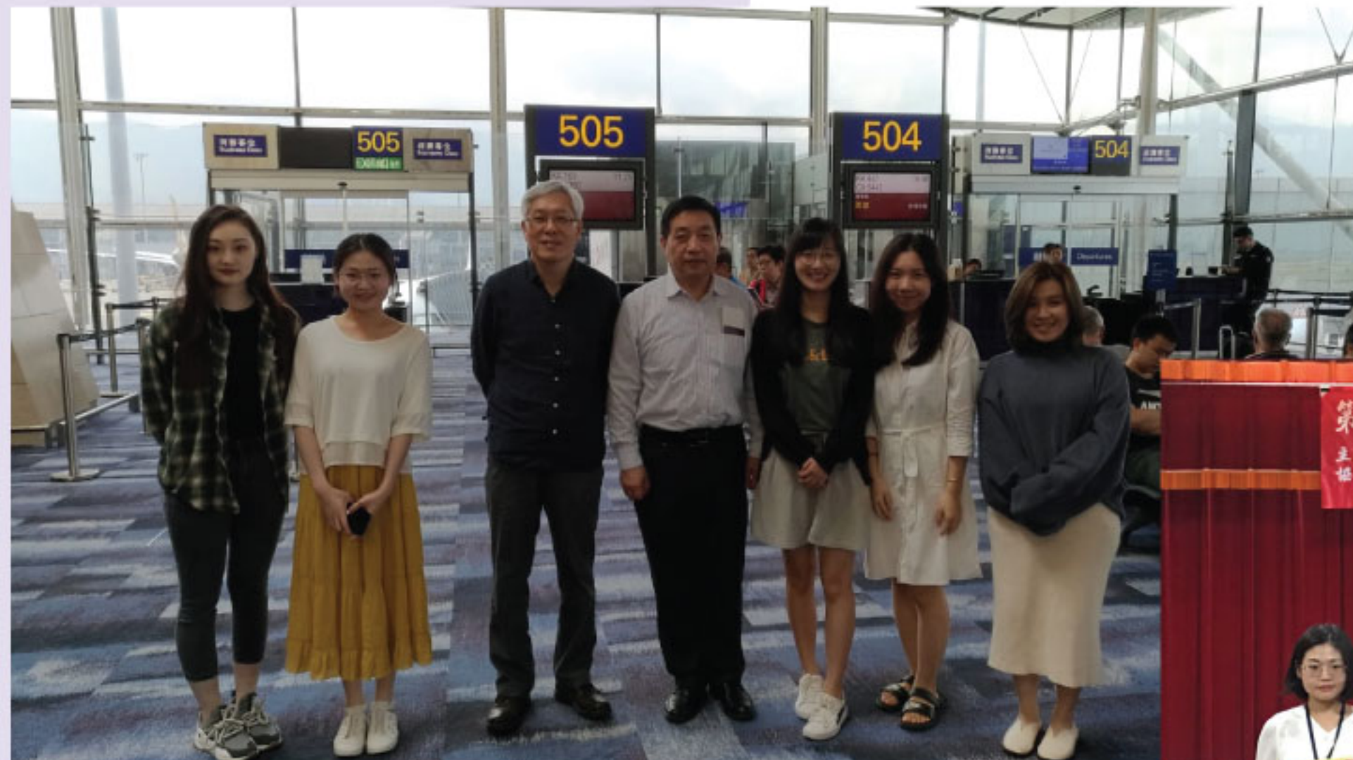
「港台五校中文系大學生論文發表聯誼會」與會學生出發前合照。 Departmental Short-term / Summer Study Tour Group photo of the "Hong Kong-Taiwan Joint University Conference for Undergraduates of Chinese Department" at the airport