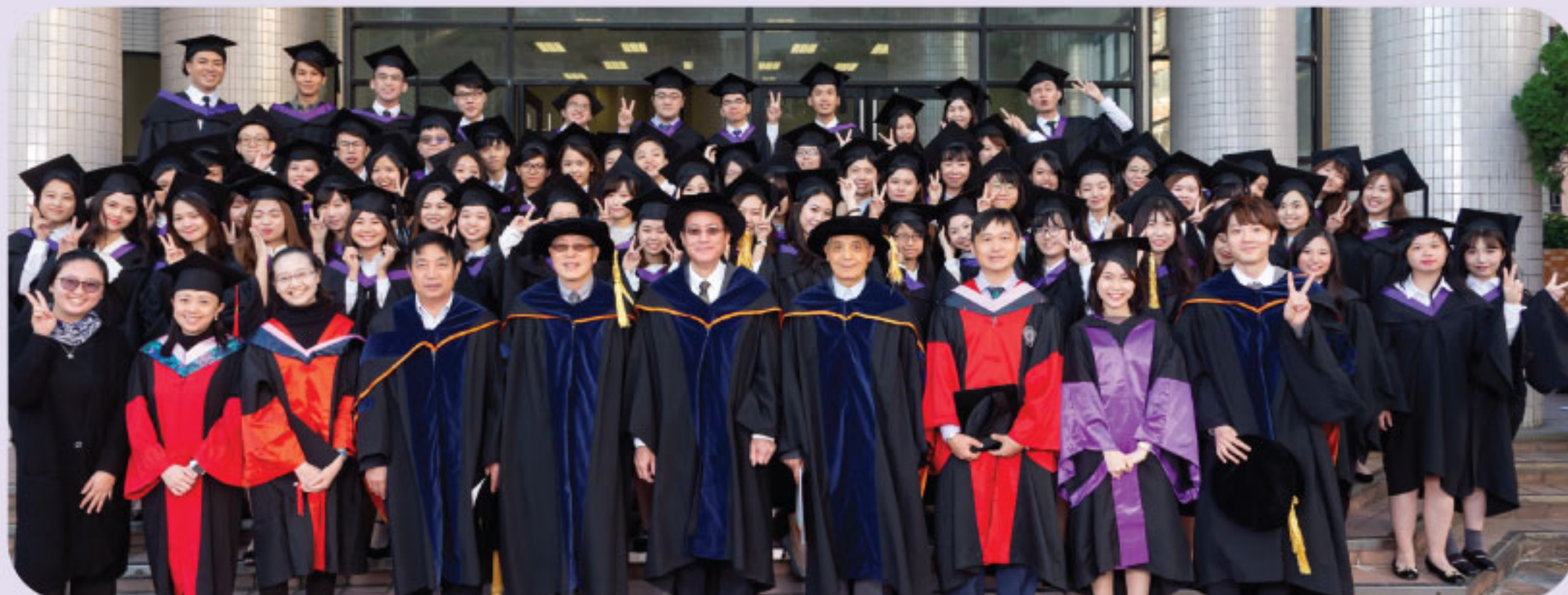
本系2018/19年度畢業生照 Department graduate photo 2018/19

文學概論 Introduction to Literary Theory 現代文學 Modern Chinese Literature 當代文學 Contemporary Chinese Literature 現當代小說 Modern and Contemporary Chinese Fiction 現當代散文 Modern and Contemporary Proses 創意寫作 Creative Writing 二十世紀西方文學理論 Literary Theory in the Twentieth Century 魯迅研究 The Study of Lu Xun 香港文學 Literature of Hong Kong 現當代中國女性文學 Modern and Contemporary Chinese Women's Literature 台灣文學 Taiwan Literature 中文科幻小說研究 Chinese Science Fiction