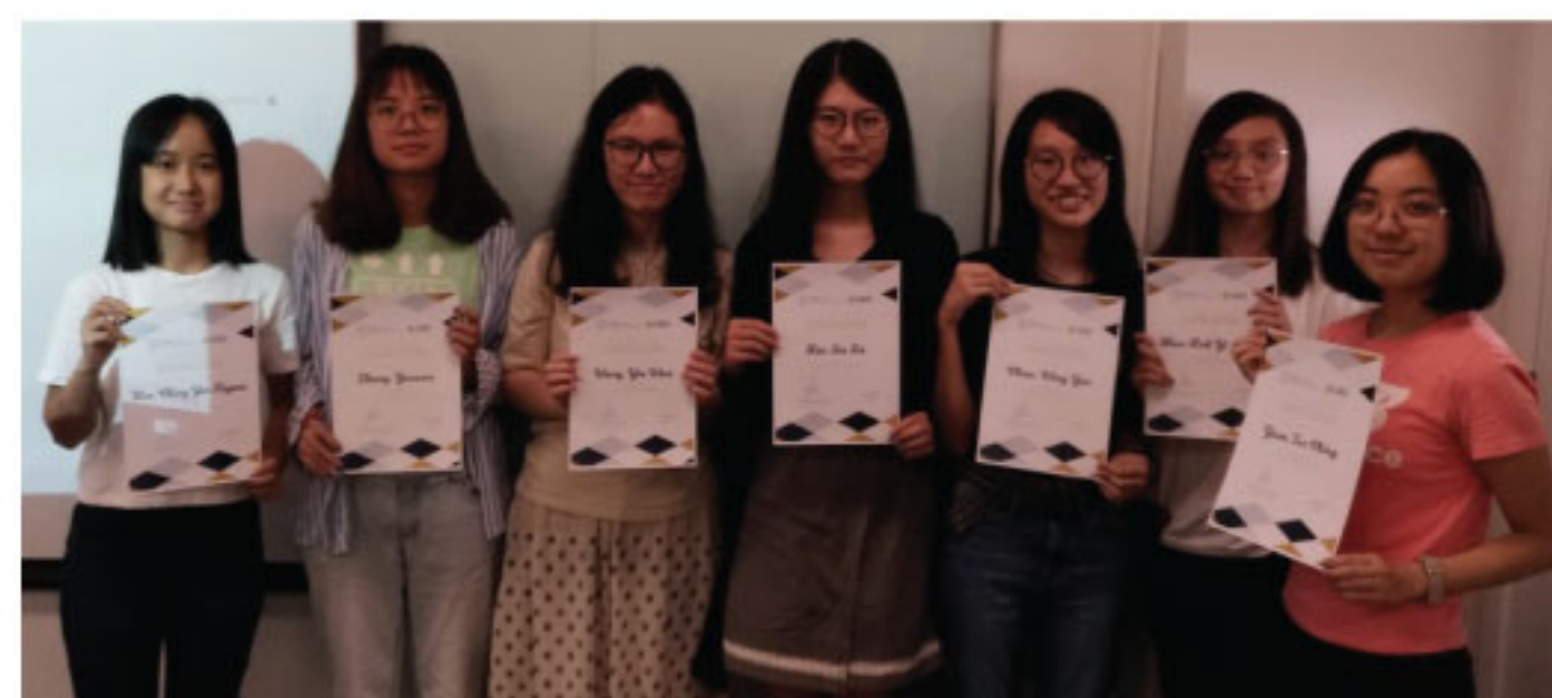
參加實習計劃的同學獲頒證書。 Students took part in internship received their certificates

經過這學期的實習，我有不少的得著，首先是語言知識的增長，在翻譯工作的過程中能夠鞏固課堂上所學的知識，因為實習提供了很多應用中文知識的機會，尤其是關於中文語法方面的知識。此外，翻譯亦需要運用英文，因此增加了接觸英文的機會，讓我在英文應用方面更加得心應手。除了語言知識的得著，這次實習亦令我對一些文書處理的軟件有更深入的認識，透過校對的工作，我能夠學會軟件中的校閱功能等等，這些知識對我平日整理資料亦很有幫助。