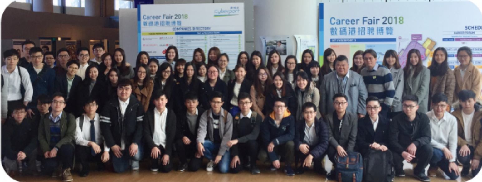
數碼港招聘博覽2018 Career Fair 2018 in Cyberport