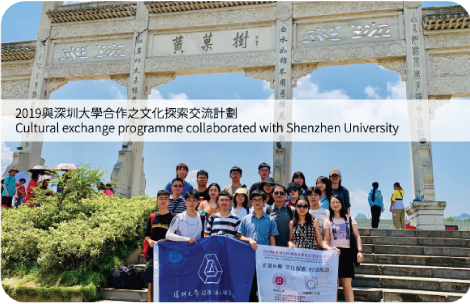
2019與深圳大學合作之文化探索交流計劃 Cultural exchange programme collaborated with Shenzhen University